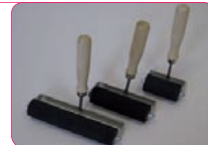
Lino Rollers: 150mm, 100mm and 60mm