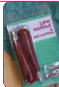
Lino Cutters - 2 handles with 6 blades