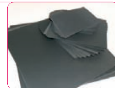
Easy-Cut Lino - softer & safer to use