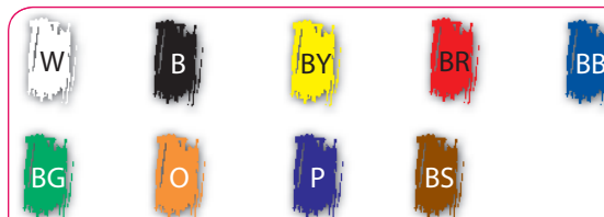
Block -printing Ink colours