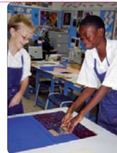
British School Muscat