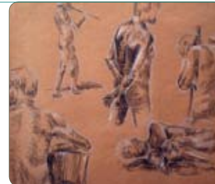
Wakefield College sketches on brown ribbed kraft paper