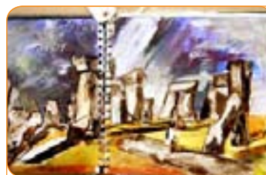
250mm Square, Loreto College